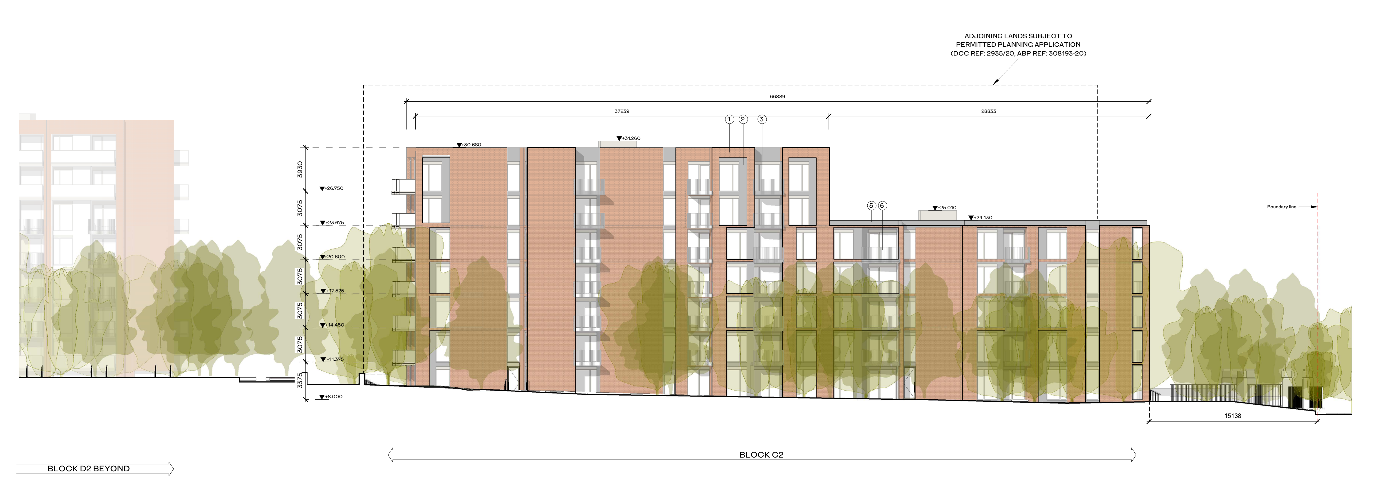
Block C2 Proposed East Elevation